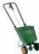
EasyGreen Rotary Spreader - SETTING 26