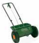
EvenGreen Drop Spreader - SETTING 5